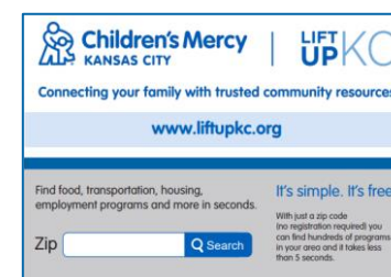
Figure 3. Lift Up KC Postcard